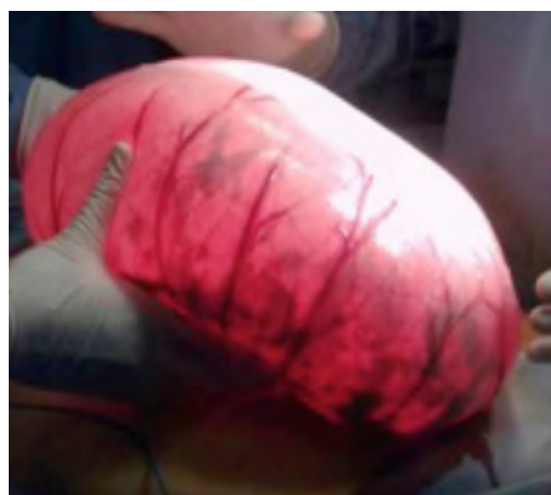
Fig. 2: Bowel Obstruction. Considerable transverse colon dilatation due to obstructing sigmoid cancer.