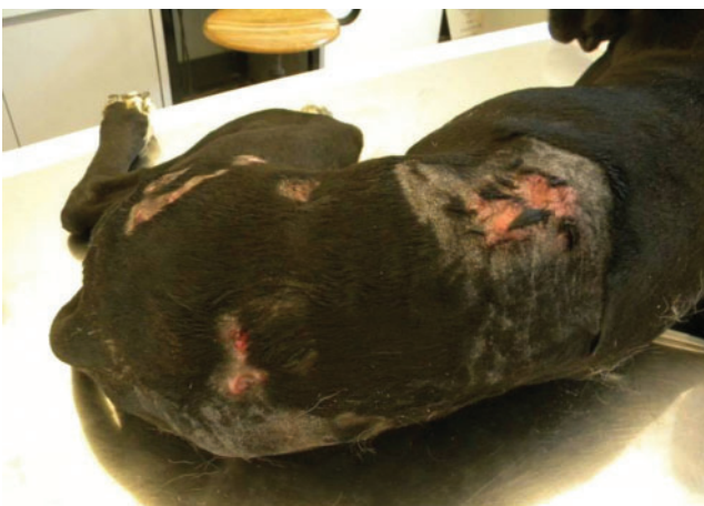
Fig. 2. Cutaneous lesions with irregular borders and purulent fluid material disseminated on the left-flank region.

Skin scraping, fine needle aspiration cytology and slit smears were done to obtain material for cytological examination. The smears were air-dried and stained with May-Grünwald Giemsa, Ziehl-Neelsen and periodic acid-Schiff stains.