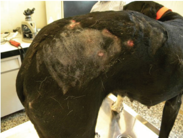
Fig. 1. Large nodular lesions on the lumbar region: fistulas and purulent exudates are present.

Sera, obtained after whole blood centrifugation, were analysed using an automatic multianalyser (Analyser Medical System). Quantitative determination of urea (Urease-GLDH. Kinetic UV), creatinine (Jaffé Colorimetric-Kinetic), alanine aminotransferase (NADH.kinetic UV.IFCC rec), aspartate aminotransferase (NADH.kinetic UV.IFCC rec), glucose (Trinder. GOD-POD) and total protein (Biuret. Colorimetric) was done using Spinreact reagents; Spintrol H Cal-Serum human calibrator and Spintrol H normal-Serum human control serum (Spinreact) were used.