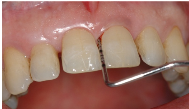
Figure 1. Bleeding on Probing (BoP): Blood coming out during probing is at this time the unique predictive test used by periodontists.

The unique predictive test used by periodontists for routinely checking the stability or progression of periodontitis is “Bleeding on Probing, (BoP)” [2], recorded by inserting a periodontal probe at the bottom of the gingival sulcus or periodontal pocket (Figure 1).