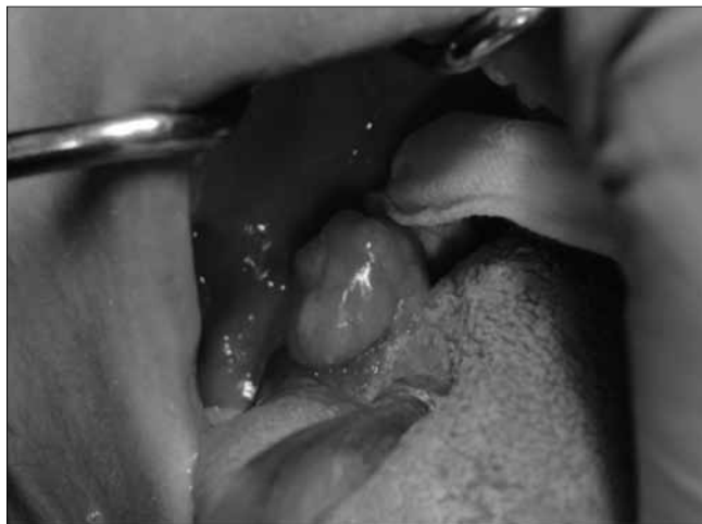
Fig. 1. Asymptomatic, non-ulcerated, firm, exophytic, oval mass on the dorsal surface in the right posterior-lateral base of the tongue.