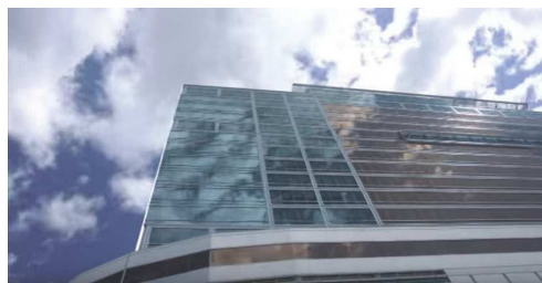
Picture 3. Eco-skyscraper