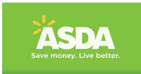
Picture 6. ASDA logo

Picture 7 displays the stickers used in the activity to teach children the right amount of vegetables that should be eaten a day, which are emphasized by the photo framing and the brilliant colours (mostly shades of green).