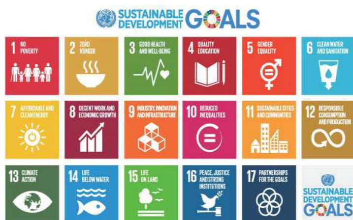
Figure 1. Sustainable Development Goals (retouched here for copyright reasons)

Walmart, the American multinational corporation and the largest retailer in the world 1 , is a relevant case in point, since its explicit, advertised goals are perfectly in line with the contemporary ‘green-oriented scenario’. Interestingly enough, Walmart’s advertising campaigns seem to echo the Sustainable Development Goals, as declared through the 2030 Agenda for Sustainable Development at the United Nations Summit on 25 September 2015. In the words of Helen Clark, the UN Development Program Administrator, “World leaders have an unprecedented opportunity this year to shift the world onto a path of inclusive, sustainable and resilient development”. The dedicated website foregrounds a graphic representation that shows such goals in a captivatingly symmetrical way, with bright colours and catchy iconic images, so as to make them visible/credible (figure 1) 2 .