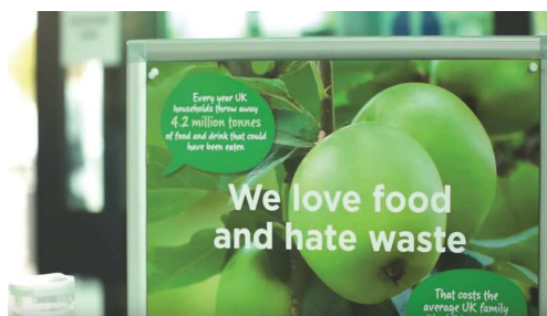
Picture 5. Love food/hate waste

To give a few visual examples, here follow some pictures taken from the video (all retouched for copyright reasons). In pictures 5 and 6, we can see the campaign slogan and the ASDA logo, which are often foregrounded in the video with their captivating bright colours (fluo-green, white and yellow) and iconic words/phrases, effectively framed in a meaning bearing visual composition.