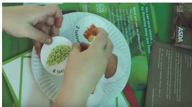
Picture 7. Food portion stickers