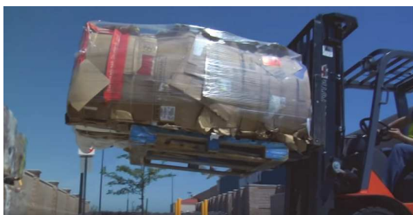
Picture 4. Re-use- Reduce- Re-cycle

Picture 4 foregrounds a phase of the much emphasised WALMART re-cycling processes, set against the background of a clean, blue sky.