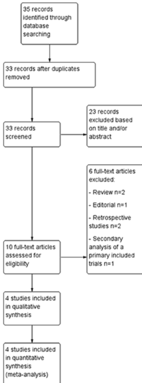
Figure 1: Flow diagram of studies identified in the systematic review (Preferred Reporting Items for Systematic Reviews and Meta-Analyses template)

Table 4 shows the primary and secondary outcomes. Overall, 94.9% of the women (982/1035) had histological biopsy results at the 6-month follow-up visit, and data were available for the primary endpoint. Pregnancy was the most common cause of loss to follow-up. About 72.9% of the randomized women (755/1035) had histological biopsy results at the 12-month follow-up. Women who received LEEP for CIN had a significantly lower persistence at 6-month follow-up biopsy (RR: 0.87, 95% CI: 0.76–0.99) [Figure 3] and significantly lower recurrence at 12-month follow-up biopsy (RR: 0.91, 95% CI: 0.84–0.99) compared to those who received cryotherapy. No between-group differences were found in the complications rate, but the analyses were not powered for these outcomes. LEEP was also associated with significantly lower risk of high-grade SIL (HSIL) at 6-month Pap smear follow-up (RR: 0.45, 95% CI: 0.28–0.75) and at 12-month (RR: 0.41, 95% CI: 0.26–0.65) Pap smear follow-up compared to cryotherapy [Table 4].