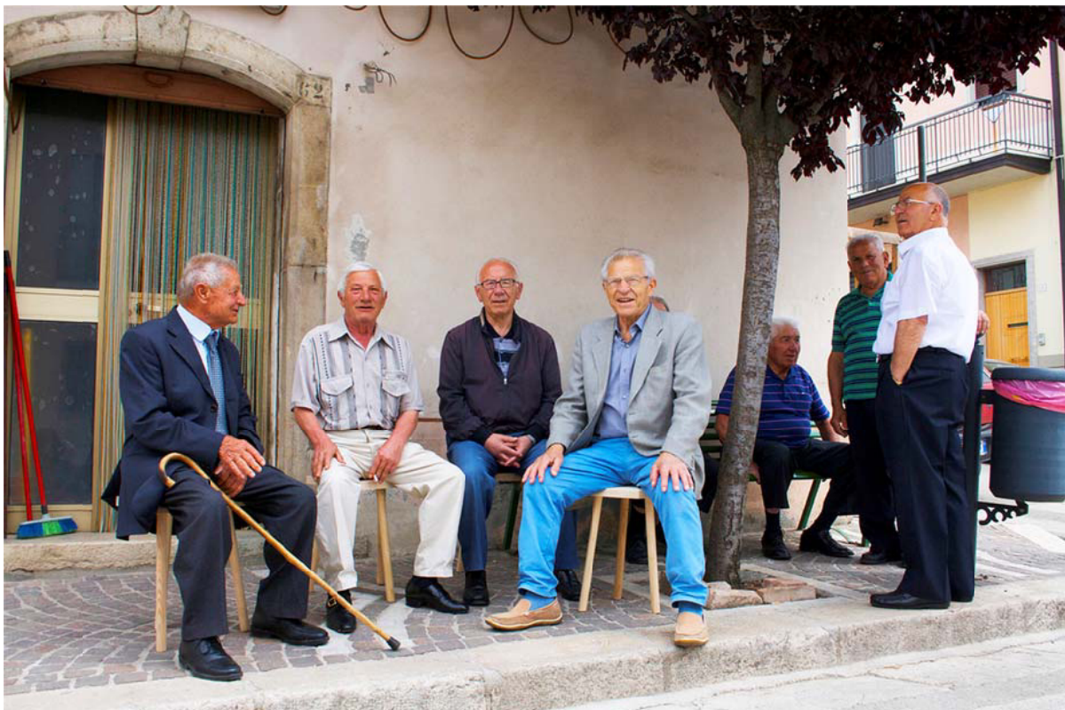
Fig. 2: Translations workshop, Alta Irpinia, Avellino (Italy), 2015: the new "stool" for an ancient use.

These spontaneous social and cultural phenomenon, as well as political changes and innovative programs, demonstrate that things are moving in the right way. The diversity of return cases and local