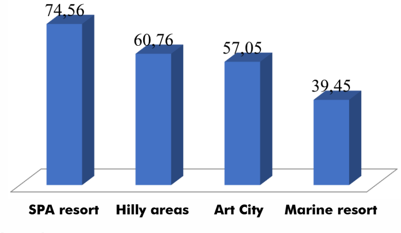
Figure 3. G<sub>mod</sub> Sustainability Index for Touristic Areas Source: Our elaboration of ISTAT's data for the year 2015

Source: Our elaboration of ISTAT's data for the year 2015