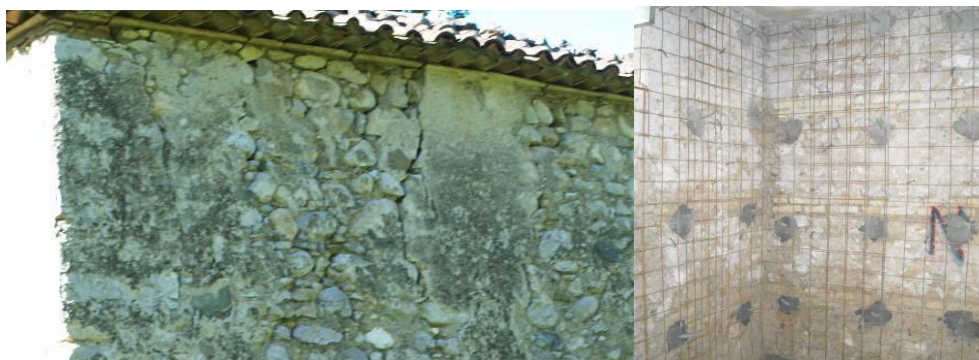
a) original solution