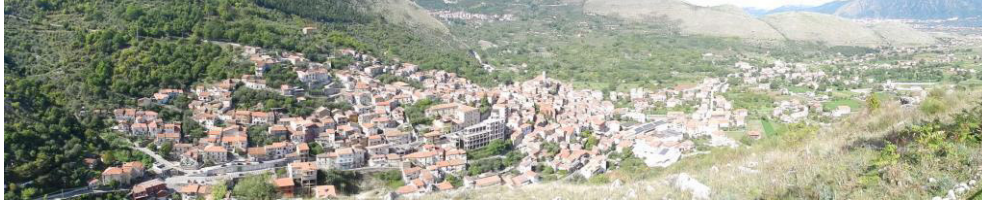
Fig. 1 – Sassano