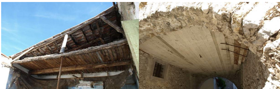
c) Original solution