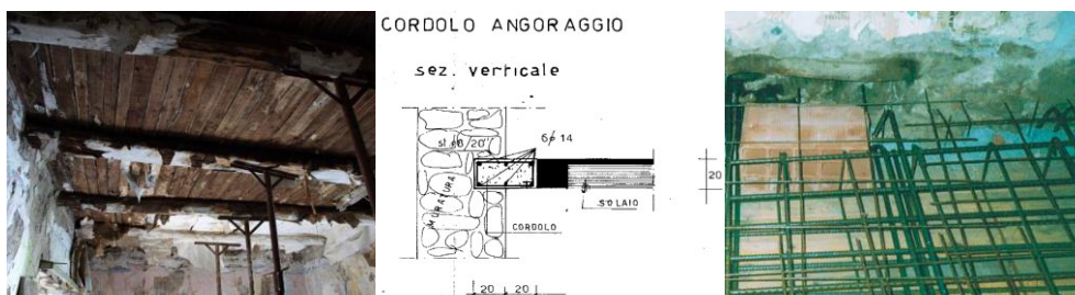
a) original solution