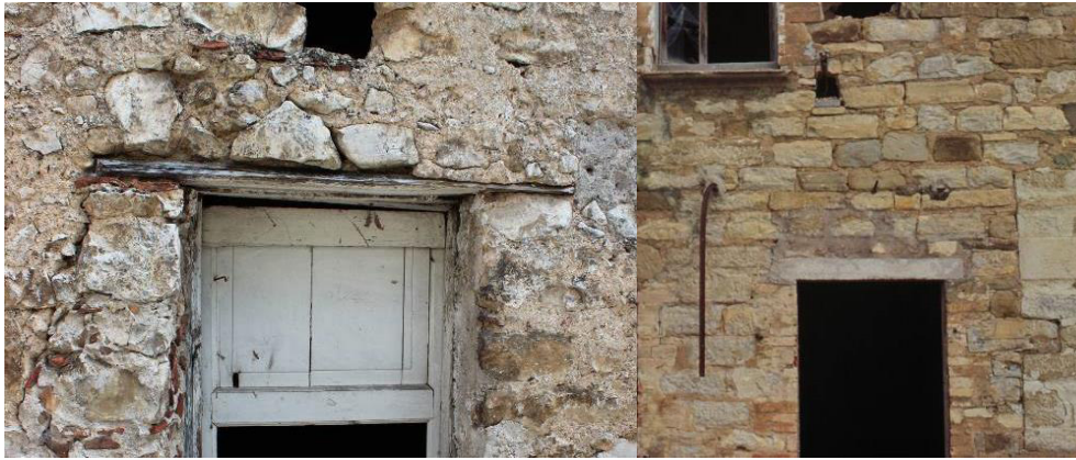
a) Original solution