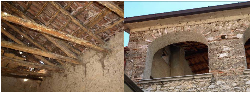
a) Original solution