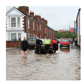
In this number CLIMATE CHANGE AND URBAN PERSPECTIVES