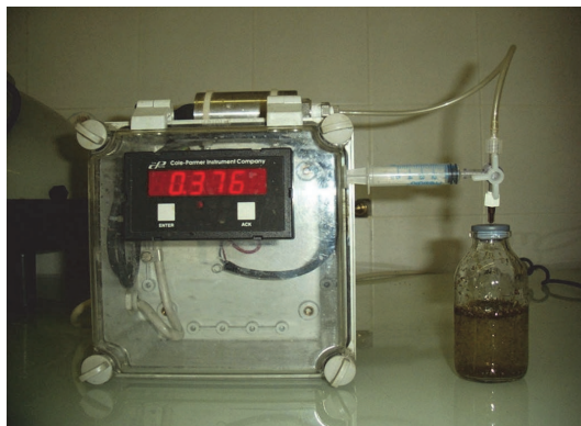
Fig. 1. Pressure transducer.

The CNCPS partitions crude protein into fractions A, B, and C, depending on their rate and extent of degradability in the rumen (NRC, 2001). Fraction A represents the non-protein N (NPN) (ammonia, peptides, amino acids) and is considered to be completely soluble; fraction B, subdivided into B1, B2, and B3, consists of true protein with progressively declining ruminal degradability. Fraction C is unavailable true protein. Broadly, these crude protein fractions are categorized into rumen degradable protein (RDP) and rumen undegradable protein (RUP). The rumen degradable protein meets protein requirements for ruminal microbial growth and protein synthesis.