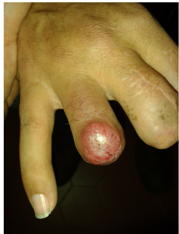
Fig. 3 The lesions tended to recur at proximal metacarpophalangeal joints of fingers amputated of distal parts

with an appropriate distance walked in relation to age and sex; a spirometry with DL_{CO} was performed, reported as normal in relation to age, sex and haemoglobin value. Mantoux skin test and IGRA test (Elispot-TB) were negative. PET/CT scan total body was performed showing amount of radiotracer in upper lobe of right lung (SUV max 4,01), mediastinal nodes (SUV max 6,70), skeleton in