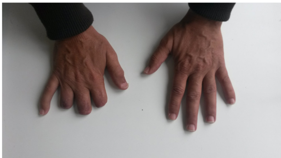
Fig. 1 Between 2008 and 2012 the patient underwent several surgical amputations of fingers: distal phalanges of second, third and fourth fingers of right hand

Ecg was normal, while echocardiography showed a little trans-tricuspid regurgitation and an assessed PAPs of 25 mmHg. Neurological examination was normal. Eye examination did not show significant pathologic findings. Blood gas analysis was normal for age, six minutes walking test was performed without pathological desaturation and