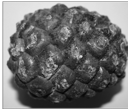
Figure 2. Brown needles on current shoot (a) and great masses of fungal fruiting on pine cone of P. pinea (b).