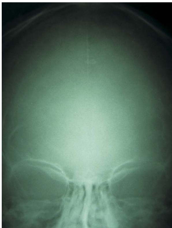
Fig. 2. Frontal cephalogram.