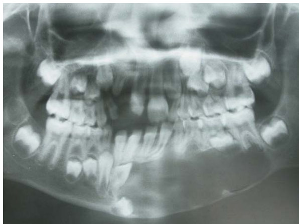
Fig. 1. Dental panoramic radiography.