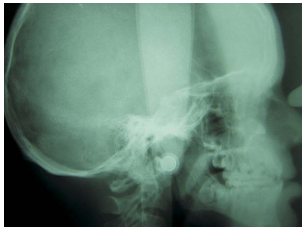
Fig. 3. Lateral cephalogram.