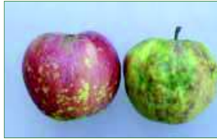
Fig. 1. Depressed and discoloured spots on the red skin of apple fruits of cultivar 'Starking Delicious' induced by ADFVd.