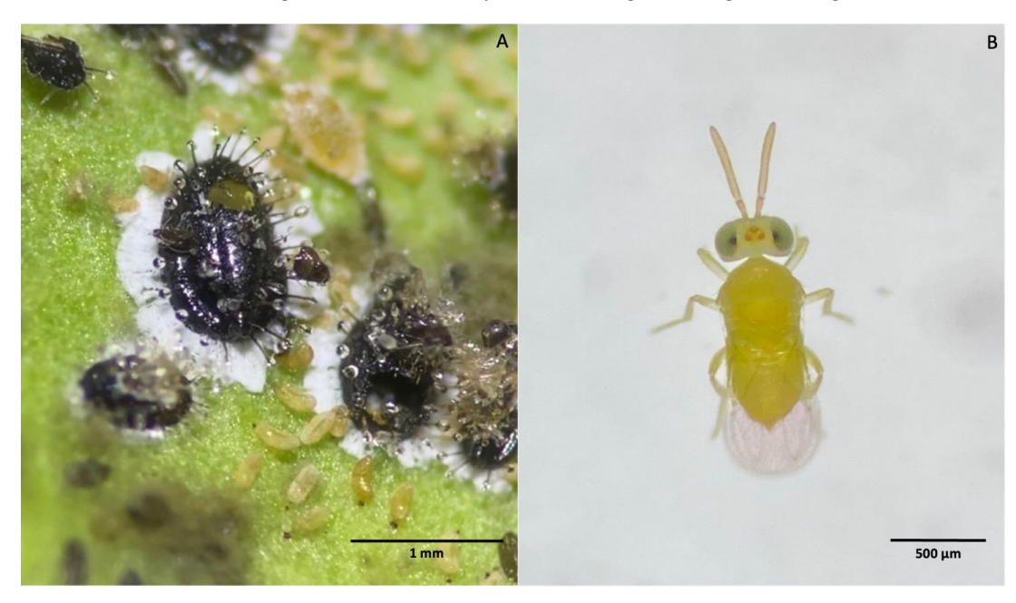
Figure 1. (A) A. spiniferus 4th-stage nymph with circular exit hole; (B) Eretmocerus sp. gr. serius adult.

small funicular segments, with the first one being ring-like and the second trapezoidal. The forewing is characterized by a short marginal fringe (Gerling, 1969) [42].