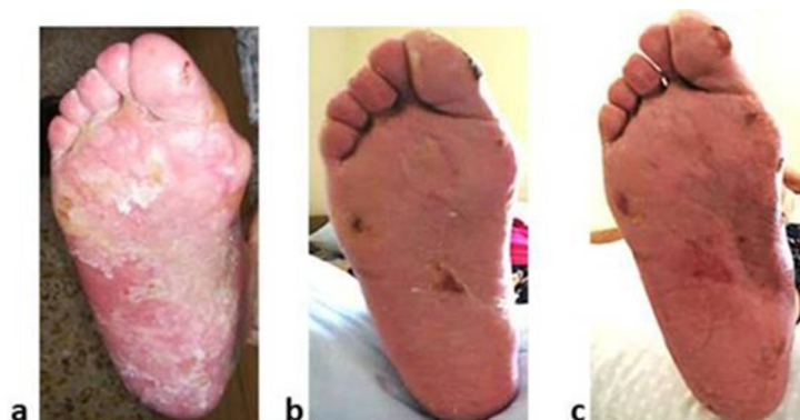
Figure 1. Pictures of grade 4 HFS developed by patient 2. The pictures were taken at different times: (a) after 15 cycles of capecitabine when the patient was concomitantly assuming folate supplementation; (b) following discontinuation of capecitabine and folate supplementation; (c) after capecitabine restarting.

demonstrating a progression of the disease with an increase in the number and diameter of tumour liver lesions. Capecitabine treatment was stopped, and a new treatment with trifluridine/tipiracil was started.