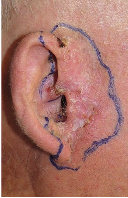
Fig. 3. Ulcerating lesion and preoperative planning.