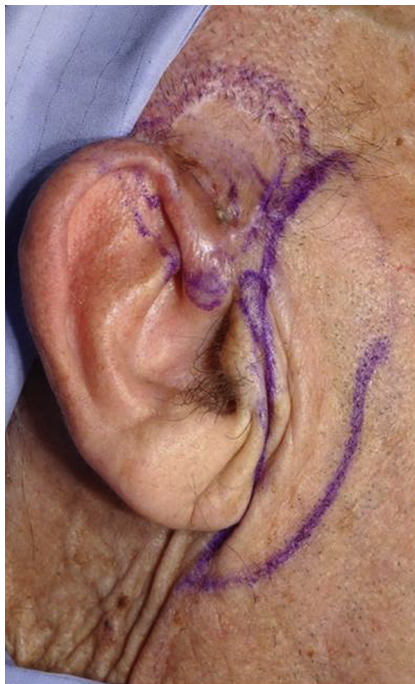
Fig. 1. Recurrent infiltrating carcinoma and preoperative planning.

A 67-year-old man was referred to our clinic for a recurrent infiltrating carcinoma of the upper pole of the right ear (Figure 1). The patient was managed under general anesthesia; resection was performed with 1-cm skin margins, including the temporal fascia on the deep aspect, representing a subtotal amputation of the right ear. Reconstruction decisions were made based on the intraoperative histological examination result (IHER). IHER confirmed an infiltrative basal cell carcinoma (BCC) with clear margins. Reconstruction with a combination of flaps was performed. The clear helical rim skin and perichondrium of the middle third of the ear was dissected off its internal cartilaginous skeleton and used as a pinna fillet flap (PFF) for the reconstruction of the residual defect. The fillet flap was advanced cranially and rotated anteriorly to cover the postauricular wound. A superiorly based preauricular transposition flap was added to complete the reconstruction of the residual upper defect. A Penrose drain was applied (Figure 2). The duration of the surgery was 1 h and 25 m. The patient was discharged the following day after drainage removal. The flap remained viable with no partial flap loss. No dehiscence of the surgical wound was observed. The result remained stable over time; no revision surgery was required. Follow-up at 12 months showed no locoregional recurrence.