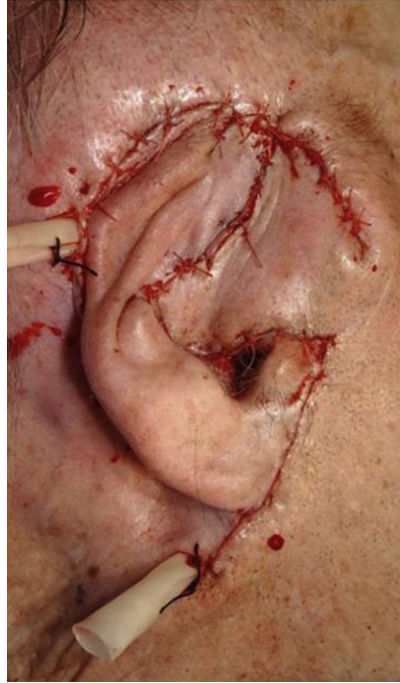
Fig. 2. Immediate postoperative result.