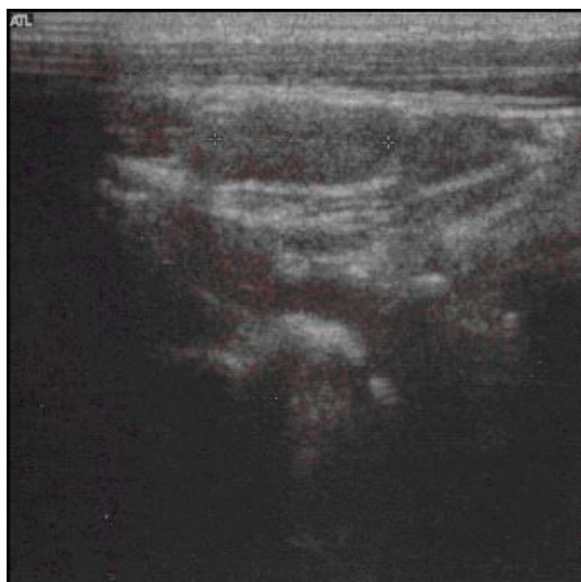
Fig. 3. Clinical case 3. Ultrasound image of a nodule at the level of the right thyroid lobe of 21x13 mm, with internal calcifications.

It was therefore considered necessary to perform a new aspiration in narcosis, in order to have a clear histological diagnosis of this neof ormation. The result was compatible with papilliferous carcinoma.