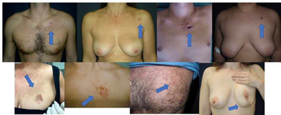
Figure 1 Series of patient pictures documenting Dermatofibrosarcoma Protuberans elective localization at the upper chest.

Considering the small number of cases we cannot draw final statements; our future intent is to understand if there