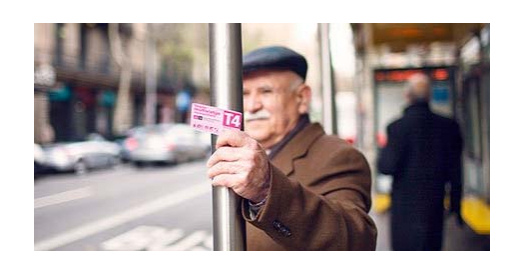
In this number AGEING IN AGEING CITIES