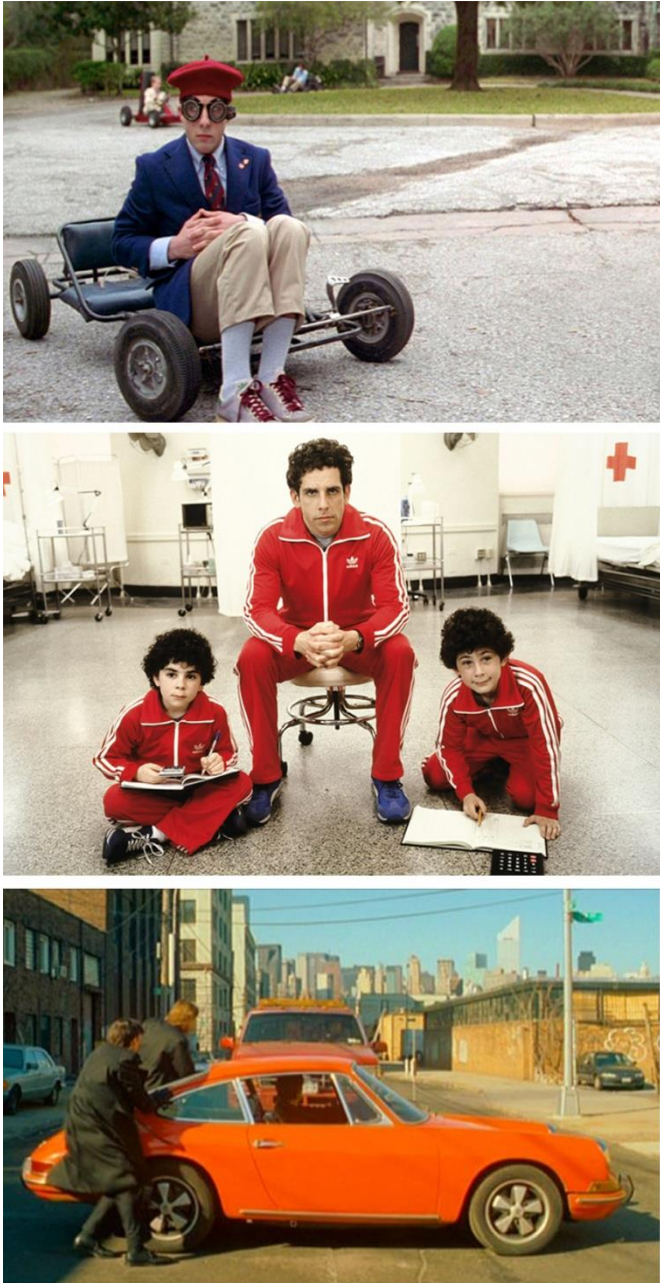
Fig. 6. The color red as an expression of the conflictual relationship with the father figure. From top to bottom: "Rushmore," "The Royal Tenenbaums," "The Darjeeling Limited"

to generate contrasts, harmonies and different chromatic weights, stimulate instead the perceptions and feelings of the viewer in relation to the stories told. The color is investigated both as a narrative content of the filmic atmosphere and as a narrative container of emotions and symbols. The double register of analysis used for Anderson's films can become a trace of a general methodology of analysis, applicable not only to the works of other directors, but also to other forms of visual narration.