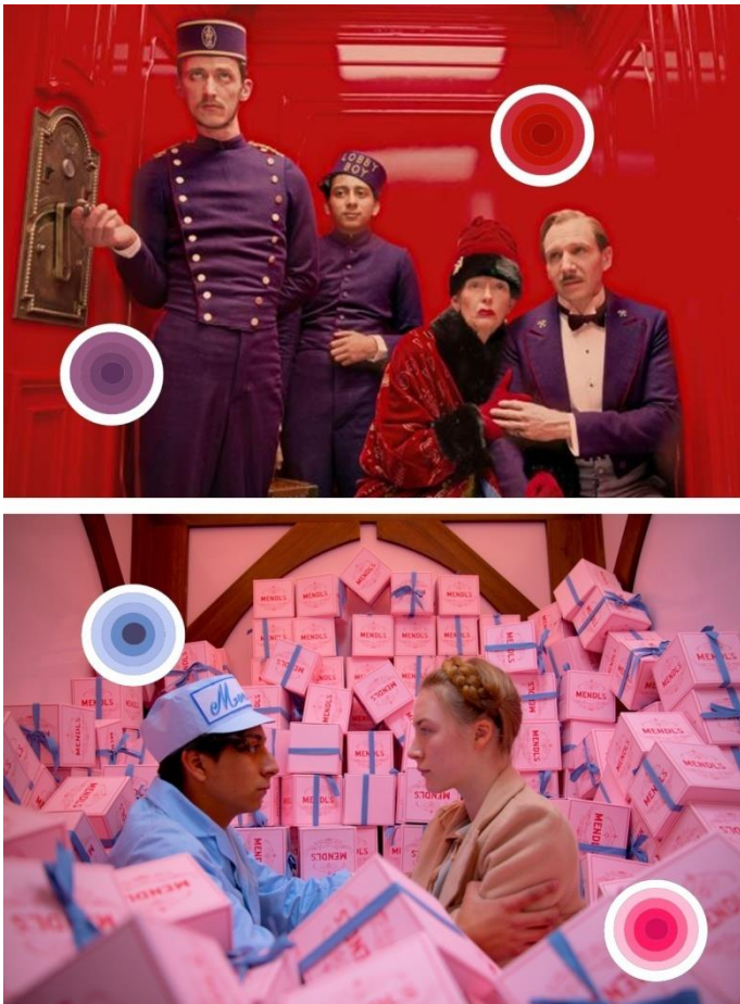
Fig. 4. Comparison between contrast and chromatic harmony in "The Grand Budapest Hotel".

(Itten, 1974): the warm tones, from yellow to red-violet, symbolize humanity and life, contrasting with the cold tones, from purple to green, which are a metaphor of brutality and dehumanization. When Richie decides to commit suicide in "The Royal Tenenbaums", the director does not show the action, but he uses color to narrate the event. The thematic opposition between death and life is in fact represented by the contrast between the soft blue that occupies the entire visual scene, and the bright red of the blood that flows in the arms of the main character. In contrast, the scene is colored with warm yellows, oranges and browns when Richie himself discovers that his tormented love for Margot is reciprocated (Fig.5). The representation of color, moreover, often coincides with the emotional states of the characters, adding depth to their characterization, as happens with the pink of the young love between Zero and Agatha in "The Grand Budapest Hotel" or with the orange of the rediscovered communion between the brothers Francis, Peter and Jack in "The Darjeeling Limited". Red, for example, seems to be a color associated with male characters' desire and issues with the father figure (Vaughn Vreeland, 2015) (Fig.6). The young Max, in "Rushmore", wears a red hat in the moments in which he has the