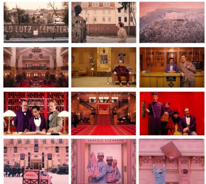
Fig. 1. The transformation of color in the narrative sequences of "The Grand Budapest Hotel".

further flattening of the images. The color, therefore, serves to support the director's message to the audience: by explaining the artifice, in fact, Anderson makes the viewer aware that what he is observing is not a faithful reproduction of reality, but a fictitious story that is located in a different world.