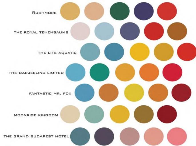
Fig. 2 Color palettes in Wes Anderson's films

the intensity and saturation of the main color in relation to those of secondary colors. In this way, the viewer can create an immediate association between color and film, thus transforming the chromatic signal into a factor of differentiation of the narrations (Fig.3).