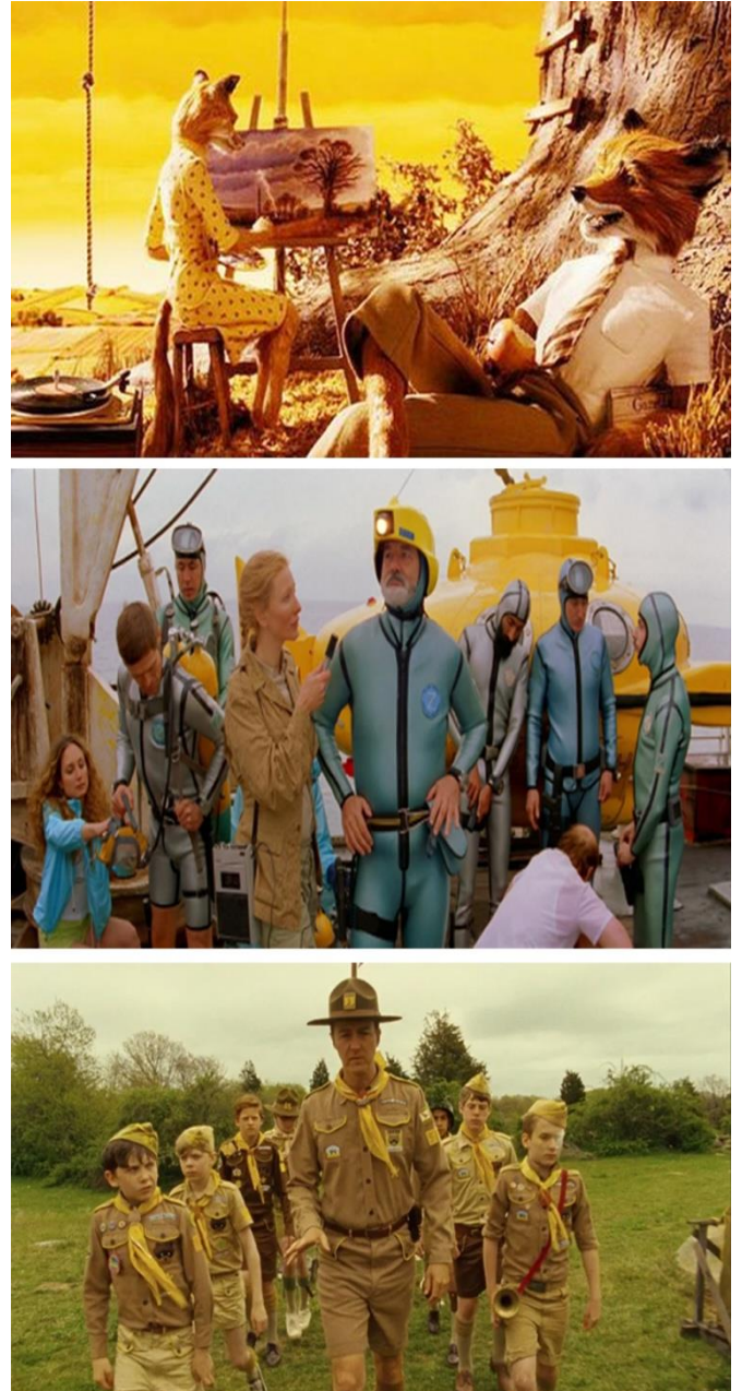
Fig. 7. The color yellow as a metaphor for union and optimism. From top to bottom: "Fantastic Mr. Fox", "The Life Aquatic", "Moonrise Kingdom"